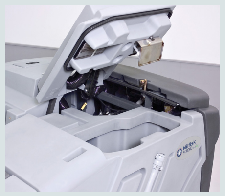
Cleaning of the machine is easy thanks to the tip out recovery tank opening with debris tray.