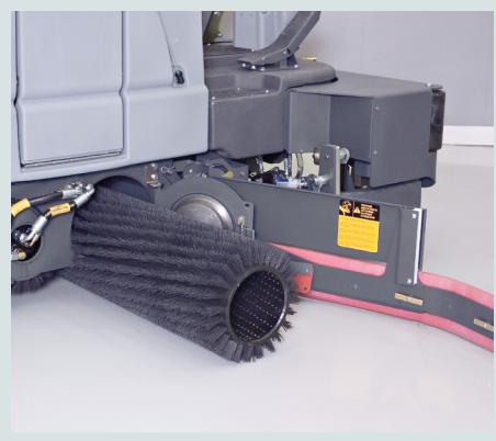
Maintenance is quick because replacement and adjustment of squeegee blades, side blades, and brushes require no tools.