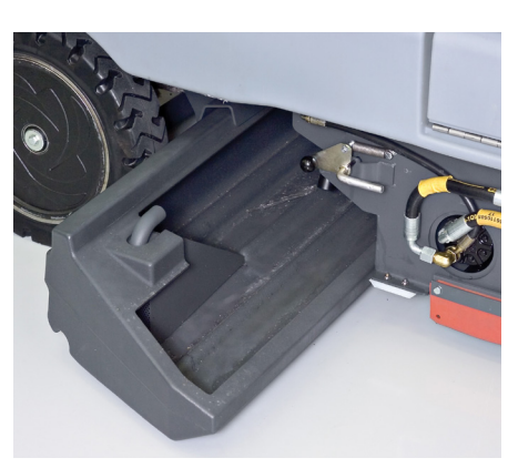
Productivity is increased with the 42 litre vacuumed hopper which is easy to slide out.

The exceptional Ecoflex system allows the operator to match the floor cleaning machine's performance to the soil on the floor and the required level of clean. When encountering more soiled areas of the floor, the operator can activate the "burst of power" button for extra cleaning performance, and as easily return to original settings for minimum usage of water, detergent and power. Green meets clean.