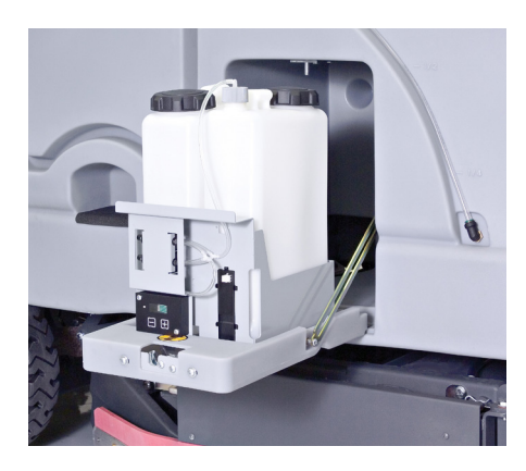
The on-board Ecoflex concept system provides productivity and savings through accurate dispensing